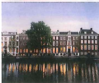
1: LAURENT PARRAULT; 2: CHRISTOPHER BEIDEL; 3: NICOLE COLE; 4: 80 ACRES OF MCEVOY RANCH; 5: NORMAN LOVE CONFECTIONS; 7: ANDERS HVIID; 8: THE NEW TRADITIONALISTS; 10: COURTESY OF WALDORF ASTORIA