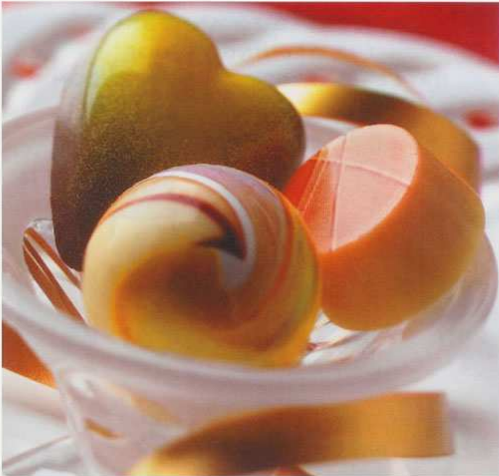
Norman Love Chocolates