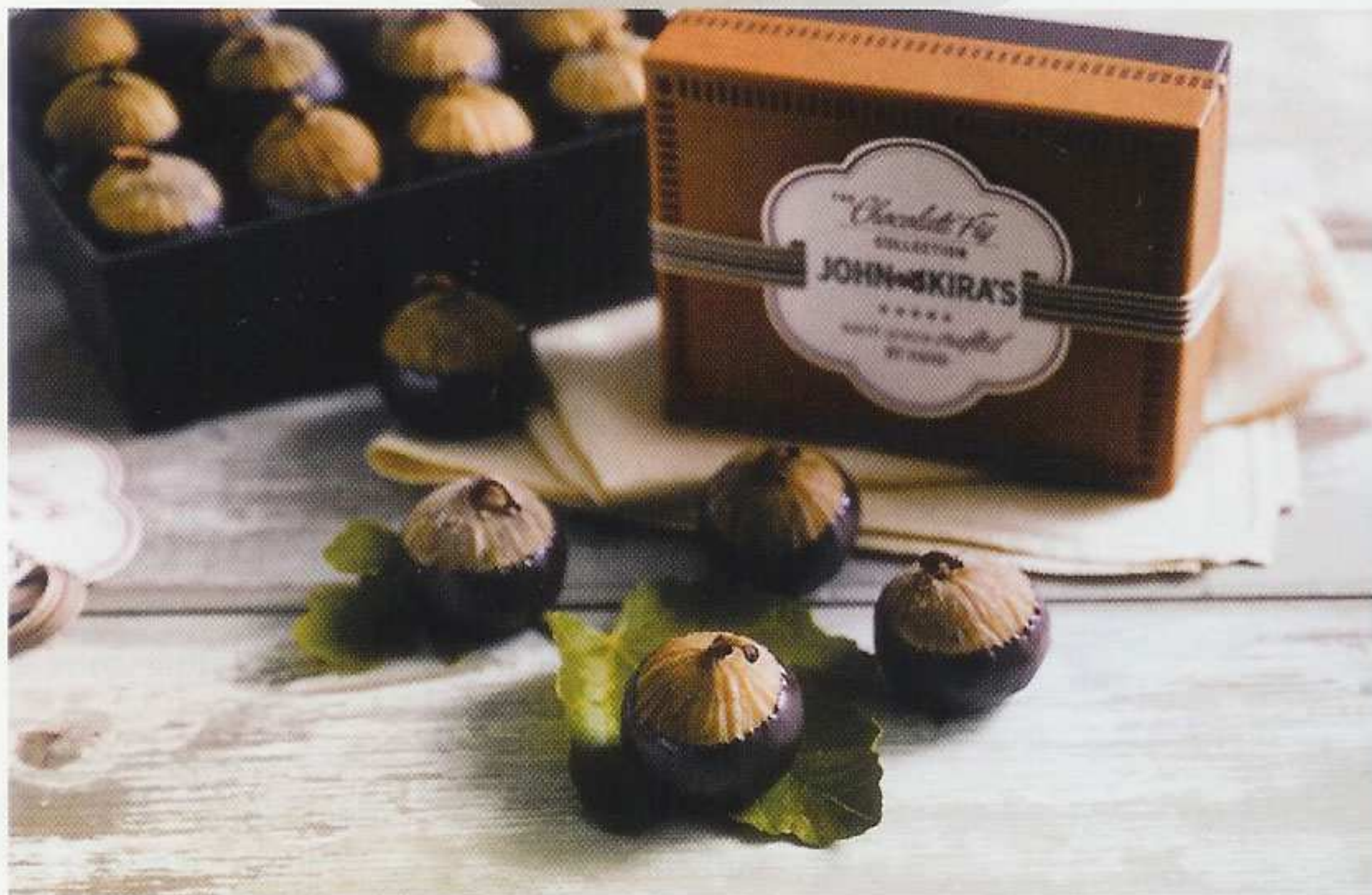
Chocolate Figs: Tender, organic dried Calabacita figs from a small family farm in Spain are filled with a silky smooth, whiskey infused Valrhona dark chocolate ganache and then hand-dipped in 62% dark chocolate. $22/6 pieces. johnandkiras.com .