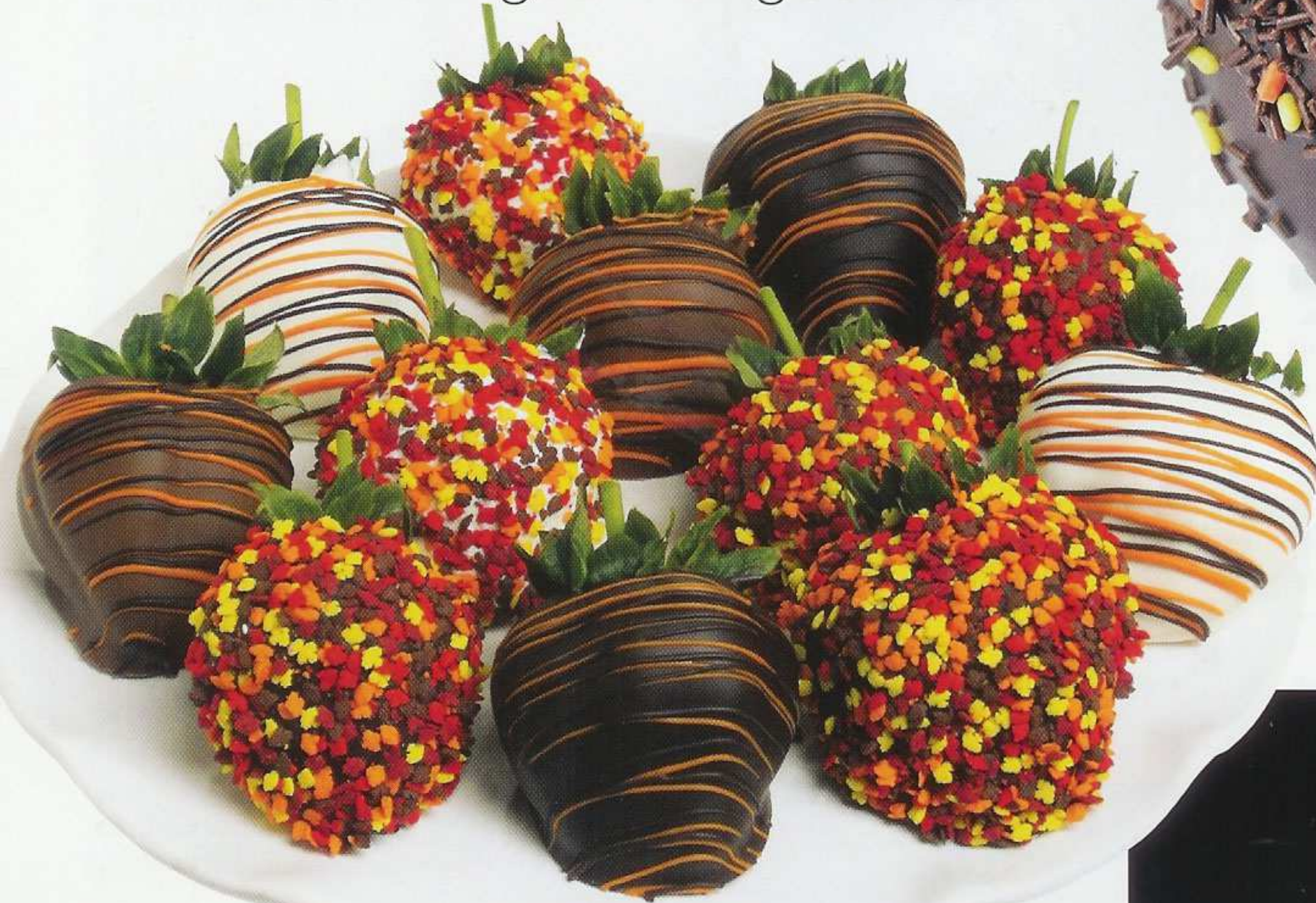
Fall Harvest Chocolate-Covered Strawberries: Fresh berries are hand-dipped in an assortment of milk, dark, and white chocolate, and artfully decorated with sprinkles and confection drizzle. Fall Berries Gift Box, $39.95/half dozen. ediblegiftsplus.com .

'Tis the season for some devilishly decadent gourmet goodies.