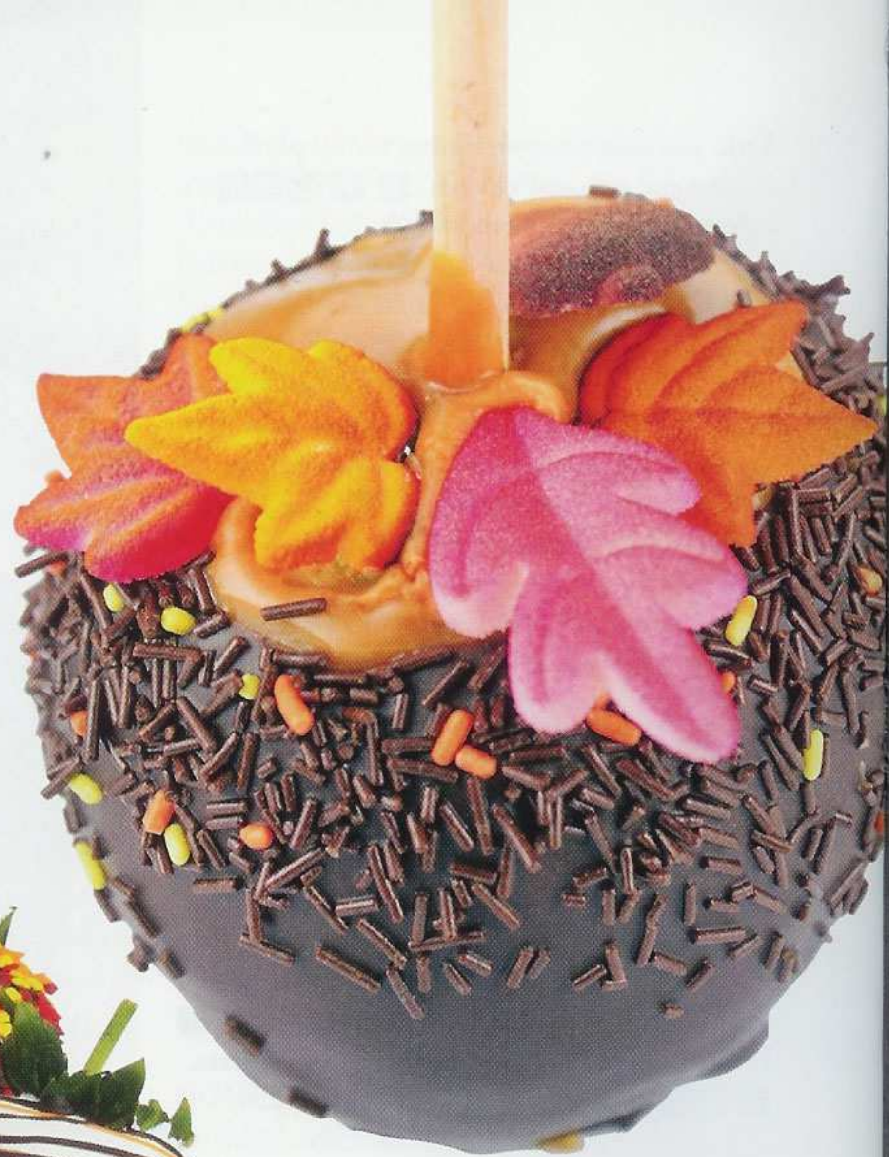
Amy's Gourmet Caramel Apples all start with a jumbo orchard fresh Granny Smith apple. This heavenly new fall concoction is covered in kettle-made caramel, coated with dark Belgian chocolate, and garnished with sprinkles and sugar-coated autumn leaves. Each is shipped fresh and beautifully packaged in a copper embossed apple box. $19.99. amysgourmetapples.com .